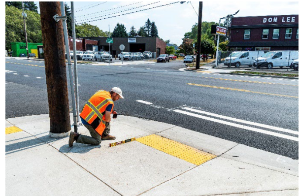
An example of an accessible sidewalk curb ramp.

There will be temporary impacts to Cascade Avenue, Oak Street and nearby streets during construction. Expect lane, shoulders, parking spaces and sidewalks to be closed for a short time. All roads will remain open. We will provide accessible paths around the work zones for people walking, biking and rolling. We will keep access open for customers of nearby businesses during business hours. No work will occur in the downtown area between Memorial Day and Labor Day.